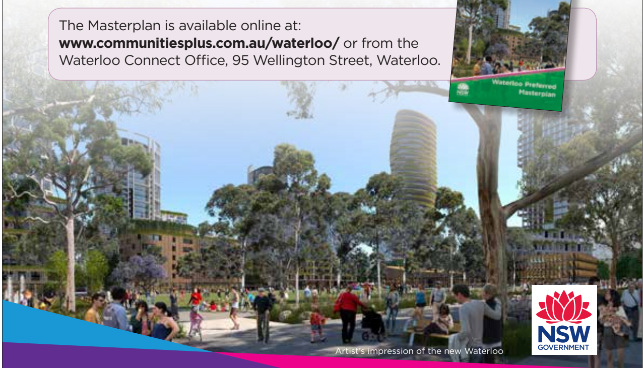
Artist's impression of the new Waterloo