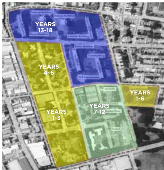
1. Indicative and subject to preferred plan finalisation.

The diagram below outlines the stages of the Masterplanning consultation program. We are now at the preferred plan stage.